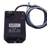
RC1433-C Wireless Receiver with Omnidirectional Antenna

USE TOGETHER WHEN WANTING TO PROVIDE CUSTOMER WITH *FREE* SERVICE