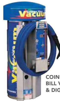
COIN ACCEPTOR, BILL VALIDATOR & DIGITAL DISPLAY