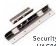
Security Kit VAC8104