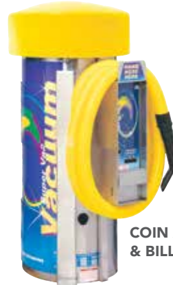
COIN ACCEPTOR & BILL VALIDATOR