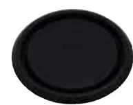
Recessed Plugs for Canister Bottom VAC5871B8