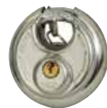
Abus Lock AB2870