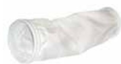
Filter Bag CWSVACFILTERBAG