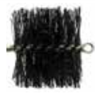
Filter Bag Brush & Handle ER887905